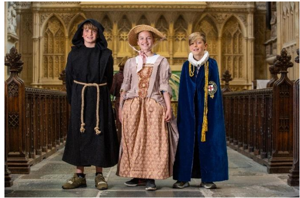
Families are learning more about the Abbey's fascinating history whilst having great fun dressing up in the Discovery Centre's wide range of replica period costumes