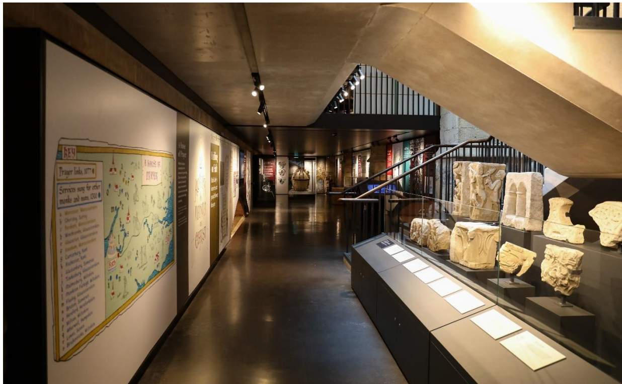
A view of the new Discovery Centre, with precious medieval stonework seen on the right

These include Anglo-Saxon crosses, medieval carved stone fragments, historic silver, and the Benefactors' Book - a record of money and materials given to the Abbey for its reconstruction after the Reformation.